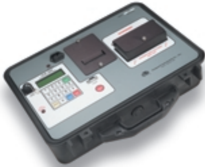
Vanguard Model IRM-5000 Megohmmeter